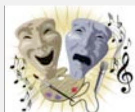
Deep River Summerfest PAGES 14-15