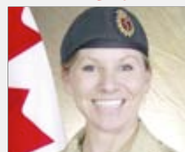
In Honour of a Fallen Hero PAGE 17