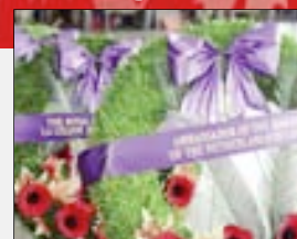
Nijmegen Sendoff PAGE 3