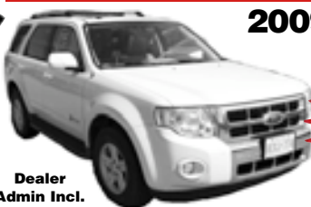
Dealer Admin Incl.

FORD EMPLOYEE PRICING. YOU PAY WHAT WE PAY.